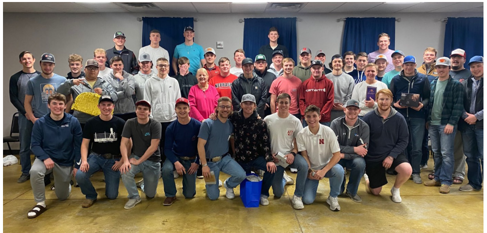
The chapter celebrated the annual Christmas gift exchange a month late this year due to the shortened fall semester. But it was fun none the less!