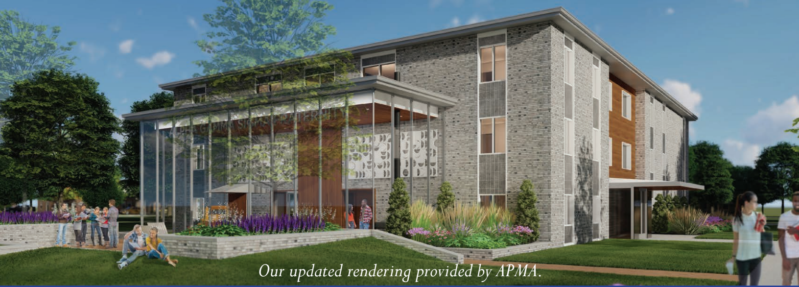
Our updated rendering provided by APMA.

Gamma Chapter of Alpha Gamma Sigma • Fall 2019