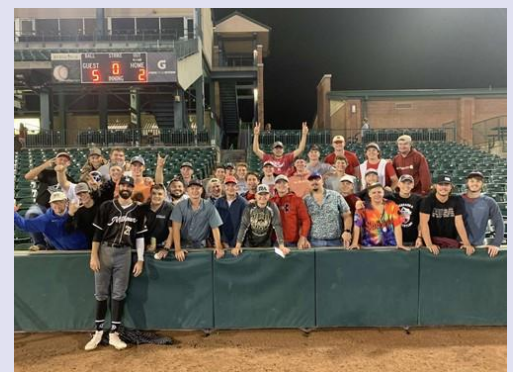
Members attend an exhibition baseball game between the Lincoln Saltdogs and the Milwaukee Milkmen.