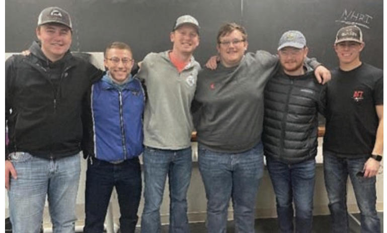
These brothers are mentors in the NHRI program. The men of Alpha Gamma Sigma do their best to set a good example in the community by staying involved.

As the spring semester winds to a close and brothers head off to their summer jobs, we celebrate the end of the first academic year in our new location at 3455 Holdrege Street. A few punch list items remain, but we are 99% complete on the interior construction. The planned exterior updates might take a year or two (depending on contractor and product availability), but the facilities are in great working order.